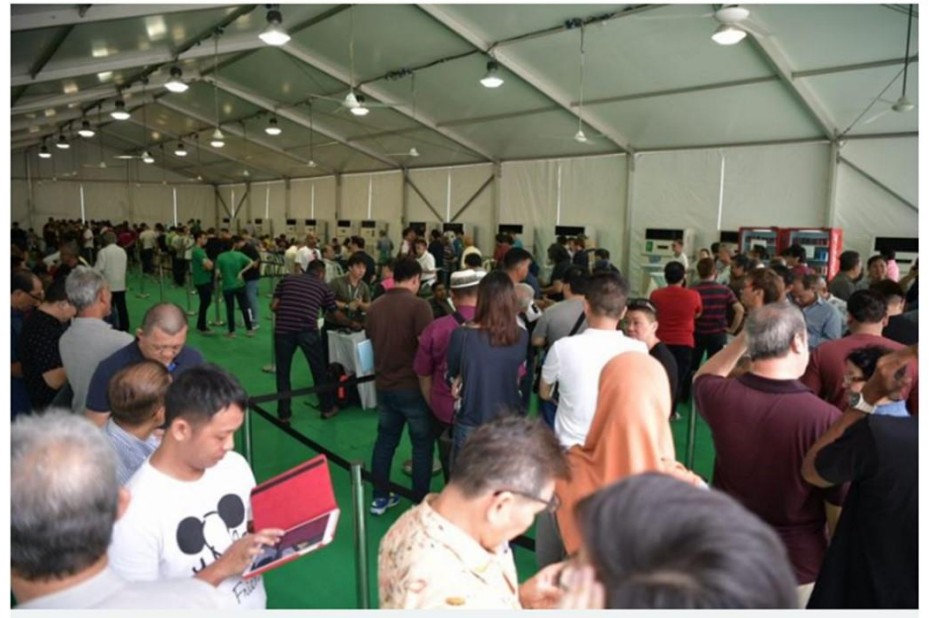
People queue up to register themselves as Grab drivers at the open-air carpark of Midview City, where Grab's driver centre is located.

Grab signs up 'thousands' of Uber drivers in Singapore