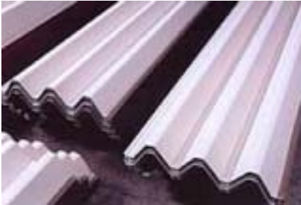
Long gauge roofs attached to steel products