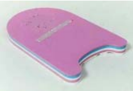
Kickboards for swimming