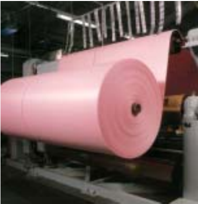
Cross-linked high-foaming polyethylene sheets