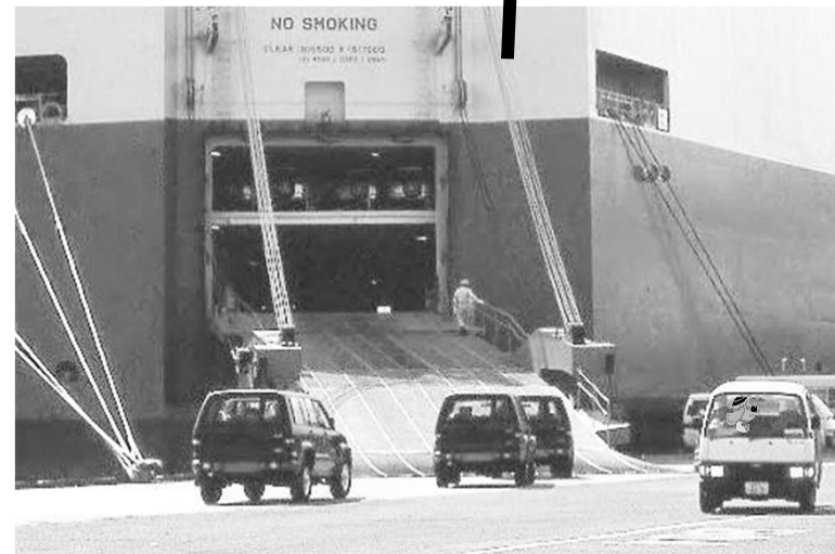
Roll-on and Roll-off way