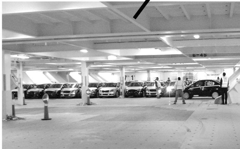
Inside of PCC