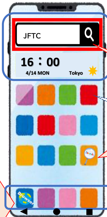
Android Smartphone Home Screen (image)