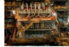
Large Marine Engines